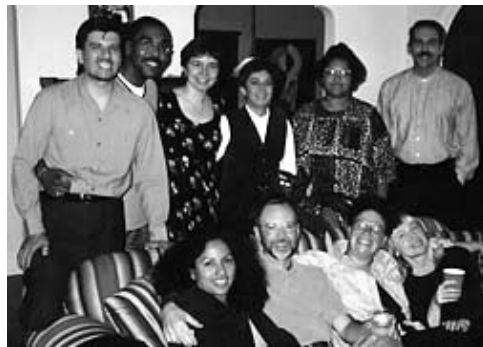
1997 visiting professors and CAPS faculty and staff